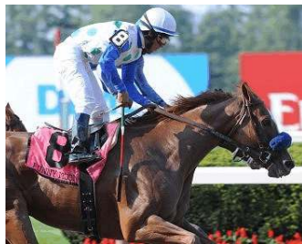
Funny Moon