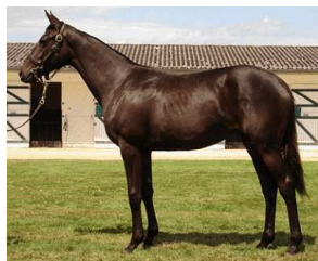
Hip 150 - Galileo filly