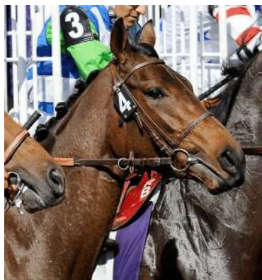
Goldikova at Santa Anita

Categorically putting to bed any doubts that she retained all her ability with an impressive fifth success at the highest level in the G1 Prix Rothschild a fortnight ago, Goldikova (Ire) (Anabaa) bids to hammer the point