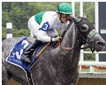
Informed Decision

The GI Ballerina S. on the Travers undercard is shaping up as a stellar affair, with this year's multiple Grade I winner Informed Decision (Monarchos) taking on champion Indian Blessing (Indian Charlie) and Music Note (A.P. Indy). Informed Decision, campaigned by Augustin Stables, is riding a five-race winning streak, all at the Ballerina's seven-furlong distance. Indian Bless-