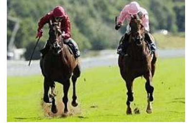
Dar Re Mi (pink) stuns Sariska

Yesterday's G1 Darley Yorkshire Oaks was supposed to be all about the G1 Epsom and Irish Oaks heroine Sariska (GB) (Pivotal {GB}), but there was a twist in the tale as that 4-11 favorite was overturned by the street-wise Dar Re Mi (GB) (Singspiel {Ire}). Sent off the 11-2 second choice, Lord Lloyd-Webber's homebred got first run on the slow-starting crowd's choice inside the final three furlongs and made that count as she grimly clung on to score by 3/4 of a length. Adding to her latest G1 Pretty Polly S. success, the bay provided trainer John Gosden with his first trophy in this race. "They set a hell of a pace and Sariska got dead aim on us all the way down the straight, but it's the first time she has met older horses," Gosden noted. Cont. p2-3