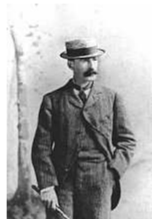
The Original Winslow Homer