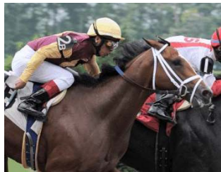
Discreetly Mine at Belmont

DISCREETLY MINE (c, 2, Mineshaft -- Pretty Discreet {GISW, $230,422}, by Private Account ), out of GI Alabama S. heroine Pretty Discreet , finished an encouraging second behind Bulls and Bears (Holy Bull) in his July 2 debut at Belmont, but could only manage a fourth-place finish after getting caught in a speed duel at the Spa Aug. 1. Assigned the rail here, the 4-5 favorite shook clear after battling through a half-mile in :45.71 to score by 6 1/4 lengths over Super Saver (Maria's Mon). The victor is a half-brother to Discreet Cat (Forestry), GISW-US & GSW-UAE, $1,694,180; Pretty Wild (Wild Again), MSW & MGISP, $398,280; and Discreet Treasure (El Prado {Ire}), GSP, $180,195. Lifetime Record: 3-1-1-0, $44,350. Click for the brisnet.com chart or Video, sponsored by Taylor Made.