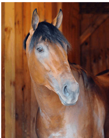
Quality Road

Trainer Todd Pletcher called an audible Sunday morning and opted to delay the last serious work for Quality Road (Elusive Quality) before Saturday's GI Shadwell Travers S. Pletcher originally scheduled the move for Sunday at 8:45 a.m., but said he postponed it to Monday after overnight rains turned Saratoga's track muddy. Quality Road is now scheduled to take to the main track this morning at 8:45 a.m.