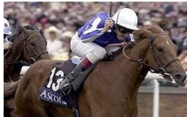
Queen's Logic

Lady of the Desert has every right to develop into an excellent performer because she is a daughter of Queen's Logic, who also won the Lowther S. before becoming a Group 1 winner with a devastating display