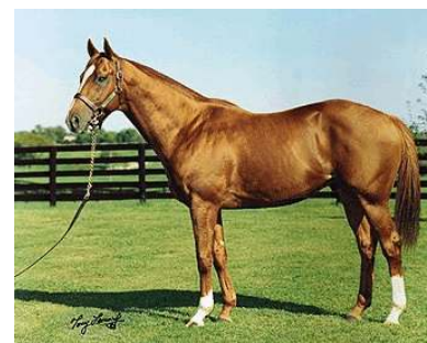
Rahy