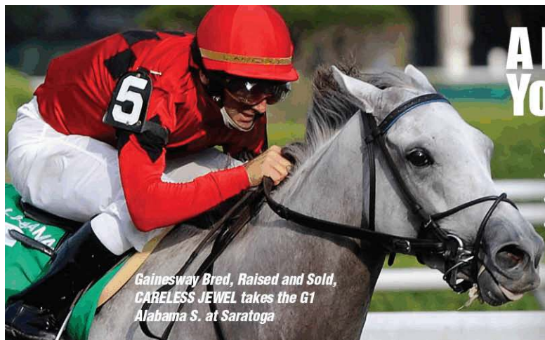
Gainesway Bred, Raised and Sold, CARELESS JEWEL takes the G1 Alabama S. at Saratoga

In related news, Rachel Alexandra's Stonestreet-owned stablemate Kensei (Mr. Greeley) will run in Saturday's $1-million GI Travers S. at Saratoga, a race that had also been considered for the super filly. Kensei is coming off a victory in the $500,000 GII Jim Dandy S. "Given how well Kensei was doing, I thought he deserved a chance in the Travers," said Asmussen. "It would be a race that would mark his career and with that decision, Rachel will be pointed towards the Woodward."