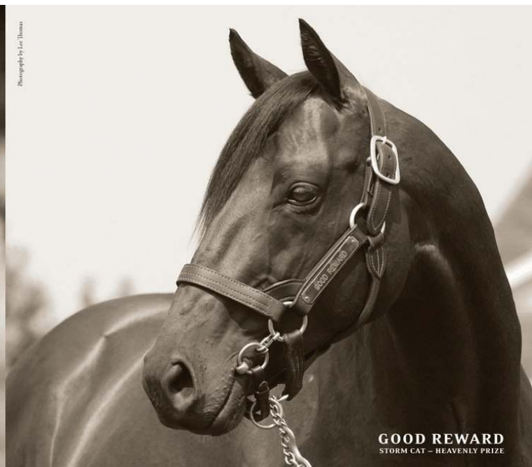
GOOD REWARD STORM CAT - HEAVENLY PRIZE