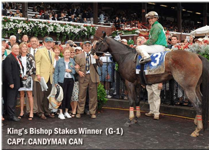
King's Bishop Stakes Winner (G-1) CAPT. CANDYMAN CAN

CO-BRED/RAISED/SOLD KEENELAND SEPTEMBER 2007