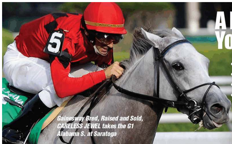
Gainesway Bred, Raised and Sold, CARELESS JEWEL takes the G1 Alabama S. at Saratoga

Fifth in the Gill Thunder Road H. rained onto the Santa Anita Pro-Ride Feb. 7, the five-year-old took an Apr. 3 allowance prep for the GII San Francisco Mile, but could do no better than sixth as the favorite in the Apr. 25 event itself. He had one start to his credit since, a third to Colonel John (Tiznow) and Becrux (Ity) (Glen Jordan {GB}) in the Wickerr H. over course and distance July 31. Midpack for the opening six furlongs, Ferneley came out for the drive and finished full of runs, as the two fillies entered in the race filled the minor placings. Click for the brisnet.com chart , the brisnet.com PPs or the free brisnet.com catalogue-style pedigree . Video, sponsored by Taylor Made.