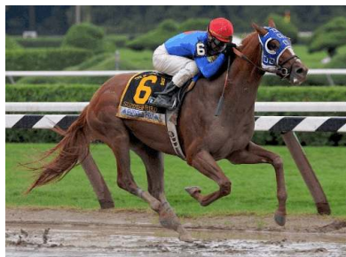
Summer Bird

Summer Bird (Birdstone) followed in the footsteps of his sire, following up a victory in the GI Belmont S. with another in the centerpiece of the Saratoga meeting, the GI Shadwell Travers S.