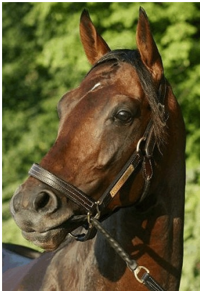
Colonel John

A field of 12 was entered yesterday for Sunday's 19th renewal of the GI Pacific Classic at Del Mar, with WinStar Farm's Colonel John (Tiznow) installed the 5-2 morning-line favorite. A star at three, Colonel John