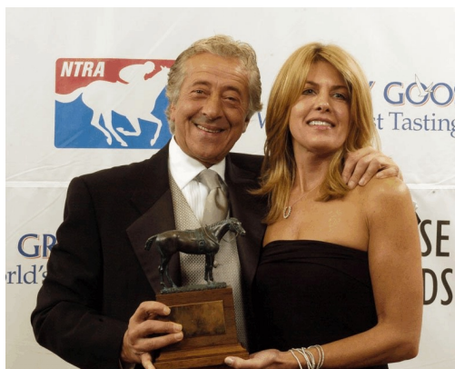
Robert & Laurie LaPenta

"The great part of it is that it is a family sport," he said. "I have a very large family. I have a son, grandchildren, nephews and a lot of friends. You can invite them over for Sunday dinner, and maybe once in six months they might come over. We're running in the Woodward this weekend [GSW Cool Coal Man and GI Belmont S. winner Da' Tara] and I will probably have 25 people there, just like we had for the Shadwell Travers. Everybody gets involved. They try to read and keep up with what is happening. This sport gets people communicating and discussing and it really helps keep everybody together. It really is a great thing."