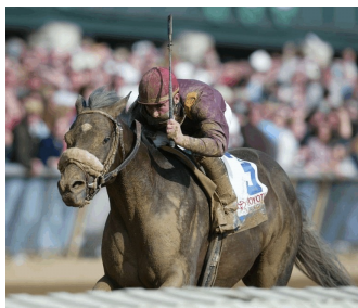
The Cliff's Edge

The Cliff's Edge (Gulch), a $200,000 KEESEP yearling purchase, scored in the 2003 GIII Iroquois S. and GII Kentucky Jockey Club S. in the fall of his juvenile season, however, his