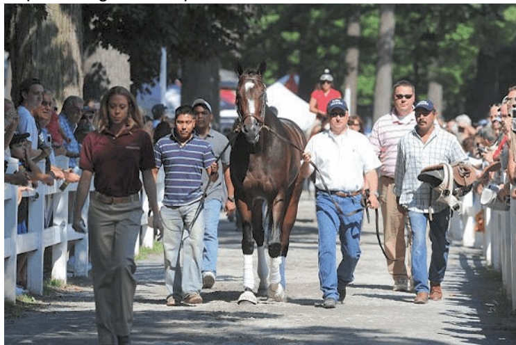
Enter the Queen: Rachel Alexandra at Saratoga Thursday