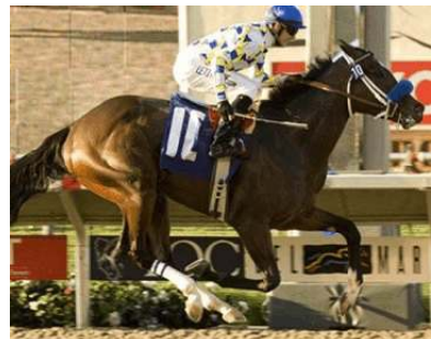
Mi Sueno

When you spend $1.7 million for a weanling filly, this is what you hope for. Connections of Mi Sueno went to that lofty figure to buy out their partners and assume full ownership of the daughter of GISW Madcap Escapade (Hennessy) at the 2007 Keeneland November sale and she'll be the one they're all gunning for this afternoon. Runner-up on debut to Necessary Evil at Hollywood Park May 31, the strapping bay was beaten into second at odds-on in a July 9 affair at the Inglewood oval. Mi Sueno was dismissed at 8-1 for the Aug. 7 GIII Sorrento S. at this track, but swooped into the stretch and overwhelmed the field, besting Necessary