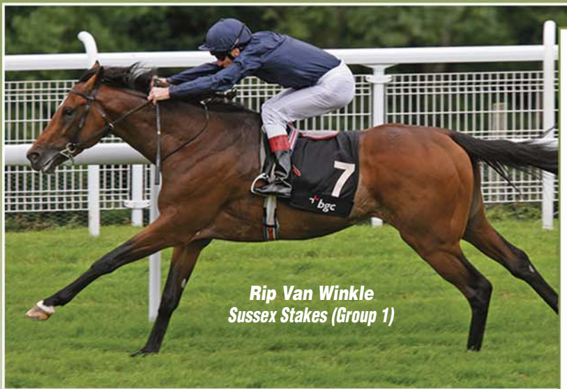
Rip Van Winkle Sussex Stakes (Group 1)