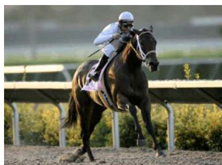
Carlsbad

Winner of her first four career starts at Turf Paradise by a combined 50 3/4 lengths, Carlsbad sought out some bigger fish to fry and was successful in her first California venture, the Mar. 29 GIII Santa Paula S. at