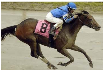
Sara Louise