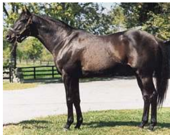
Cryptoclearance (1984-2009)