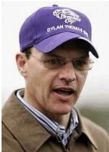
Aidan O'Brien

Rip Van Winkle (Ire) (Galileo (Ire) has put some grey hairs on Aidan O'Brien's head so far this term, but after a string of setbacks, things have gone relatively smoothly as far as his preparation for today's G1 Queen Elizabeth II S. is concerned. The team at Ballydoyle have had their work cut out just to get Susan Magnier, Michael Tabor and Derrick Smith's talented colt to the races this season following 11th-hour scares due largely to his well-documented foot problems. He finally lived up to his raw talent when making Sea the Stars (Ire) (Cape Cross {Ire}) pull out the stops in the July 4 G1 Eclipse S. at Sandown before outgunning Paco