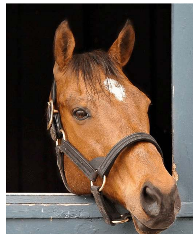
Kona Gold