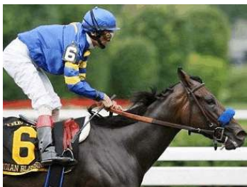
Indian Blessing