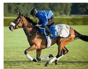
Long Lashes godolphin.com

Long Lashes (Rock Hard Ten) has not required much racing to attract attention from the right sources and steps into today's G1 Meon Valley Stud Fillies' Mile at Ascot with all eyes trained on her. Snapped up by Godolphin following her debut win in the June 26 Listed Ballygallon Stud S. at The Curragh, where she earned "TDN Rising Star" status, the bay followed up in Newmarket's G3 Sweet Solera S. Aug. 8 before failing to act on the heavy ground when fourth in the G1 Moyglare Stud S. back at The Curragh last time Aug. 30. Trainer Saeed bin Suroor commented. "The ground was too soft for Long Lashes in Ireland, but she looks very well at the moment. She is in good form, and I think that the step up to a mile will suit her. It is a Group 1 race and she will be up against some tough opposition, but I am very happy with her condition at the moment." Cont. p2