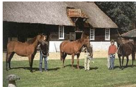
One In A Million, Repricolor & Odeon (l to r)