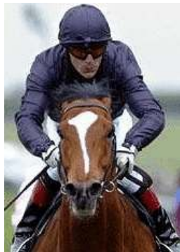
George Washington

The summer of 2007 saw George Washington race three times in Europe. Although fractious on occasion and unable to add to his list of victories, he showed enough to suggest that a large portion of the brilliance remained locked within his handsome frame. Confidence was high among the Ballydoyle camp that "Gorgeous George" could secure a famous triumph in the 2007 GI Breeders' Cup Classic at Monmouth Park, and there was even speculation that the stallion might be given a second chance at stud. Sadly, all hopes were dashed when George Washington fractured a leg and was euthanized.