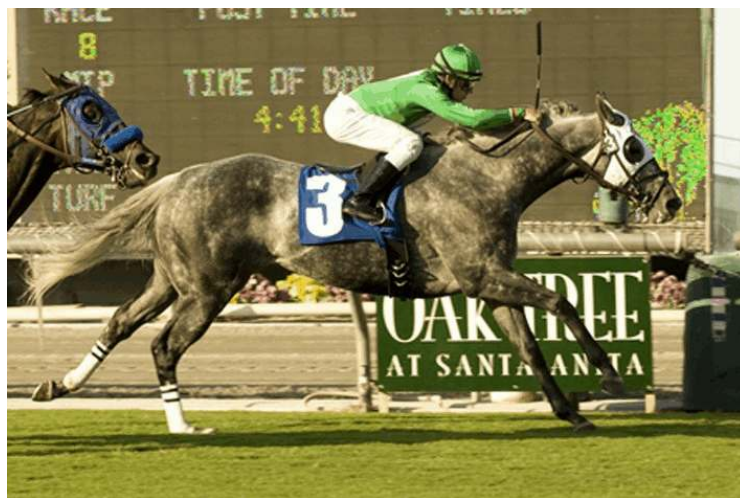
California Flag Repeats in Wednesday's GIII Morvich H.