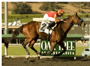
Lookin at Lucky

Punching his ticket to the GI Breeders' Cup Juvenile Nov. 7, Lookin at Lucky (Smart Strike) left no doubt who the best two-year-old in California is by adding a second Grade 1 triumph to his resume in Sunday's GI Norfolk S. "This was his first time long and he handled it perfectly," said winning rider Garrett Gomez. "He made the lead turning for home and when he did, he threw his ears up and kind of waited.