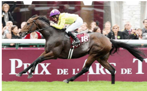
Sea the Stars

Guided by the incomparable nerve of Mick Kinane, Sea the Stars (Ire) (Cape Cross {Ire}) emerged from the cauldron of the G1 Prix de l'Arc de Triomphe with a reputation pitched into the stratosphere, registering an emphatic two-length success in yesterday's 88th renewal. Despite the scarcely believable exploits of the Tsui homebred so far in 2009, there was no sign of any wear-and-tear. The 4-5 favorite over-raced from the outset, and continued to pull even after his jockey had buried him in the pack against the fence. While that is the quickest way around Longchamp, it is not a route without anxiety, and for a brief period in early stretch with space in short supply, it seemed as though his quest for immortality was in jeopardy. When a half-gap appeared, the brilliant winner of two Classics and a total of five Group 1s delivered his spellbinding acceleration to cut a swathe between the G1 Prix Vermeille protagonists Stacelita (Fr) (Monsun {Ger}) and Dar Re Mi (GB) (Singspiel {Ire}), and once he was in front with 250 meters remaining, the story was told. In the end, it was Youmzain (Ire) (Sinndar {Ire}) who emerged best of the rest to fill the runner's-up berth for the third consecutive year. Trainer John Oxx was typically calm afterwards when saying, "It's just a relief that he came through it and it's wonderful that it's over. He had to have the gears to get out, and Mick wouldn't panic, because he knew he had them. We were not too alarmed at any stage." Cont. 2