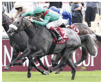
Rosanara