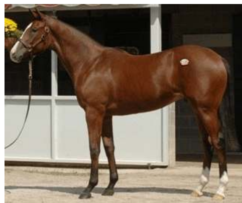
Ailalea as a yearling

5th-BEL, $44,000, Msw, 2yo, f, 1m, 1:38 1/5, gd. AILALEA (f, 2, Pulpit --Wood Sprite {SW}, by Woodman) bobbed at the break in her debut at Saratoga July 30, but made up some ground to be third, beaten over seven lengths. She again rallied when a close-up fourth going seven furlongs at the Spa Sept. 6, and was a 6-1 shot adding more ground here. The Starlight colorbearer was content to track near the back of the pack up the backstretch, but began picking off foes with a wide move rounding the turn. She turned into the stretch with a full head of steam, dueled briefly with Quiet Temper (Quiet American) and put that rival away en route to the sharp four-length triumph. Quiet Temper was easily second best. Favored Muhaawara (Unbridled's Song--Habibti) was a dull fourth. The victress, a $340,000 KEESEP yearling, is a half to Spritely (Touch Gold), MSW & GISP, $462,628; and Sea of Trees (Belong to Me), GSP, $303,335. Lifetime Record: 3-1-0-1, $34,400. Click for the brisnet.com chart or Video, sponsored by Taylor Made. O-Starlight Partners. B-BryLynn Farm Inc (KY). T-Todd A Pletcher.