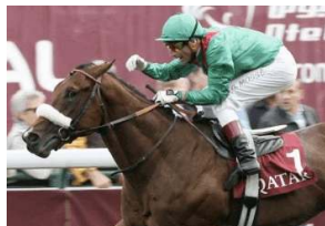
Siyouni (Fr) France Galop/APRH

Siyouni's second dam Slipstream Queen (Conquistador Cielo), black-type placed at four for Hermitage Farm in 1994, was purchased by