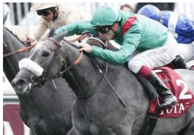
Rosanara (Fr)

In 1978, the Aga Khan acquired Marcel Boussac's bloodstock for a reported £4.7 million and, in 2005, made a lock, stock and barrel purchase of the late Jean-Luc Lagardere's equine holdings for an estimated €40-50 million. It was only fitting that the Aga Khan's green-and-red colors were flown in both of the races named for those legends of the French Turf with