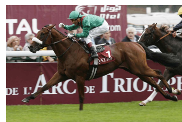
Siyouni France Galop/APRH