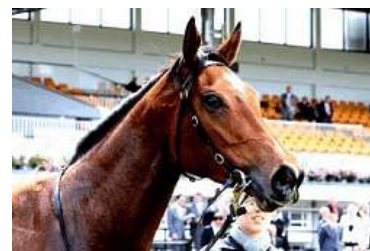
Irish Lights stallions.com.au