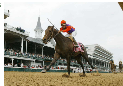
Don't Get Mad Horsephotos

the horse itself. I think they are magnificent creatures, and I really enjoy the racing game."