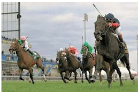
Marsh Side

Woodbine hosts its biggest day of racing this afternoon, with a trio of graded stakes worth a combined $3.5 million (Canadian funds), and each offering the winner a berth on Breeders' Cup weekend. The GI Canadian International is the centerpiece of the card, offering a purse of C$2 million, and each of the top three finishers from last year's running are back. Marsh Side (Gone West)