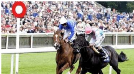
Doctor Fremantle (right)