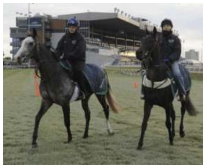
Jukebox Jury (left)