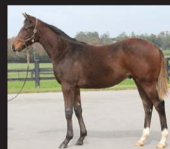
Hip 1012 Corinthian-Silver Lace Colt selling at Keeneland NOV.