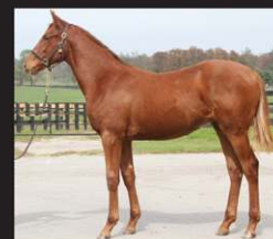
Hip 1044 Corinthian-Takeaway Colt selling at Keeneland NOV.