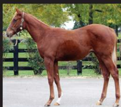
Hip 315 Corinthian-Summer Scene Colt selling at Keeneland NOV.