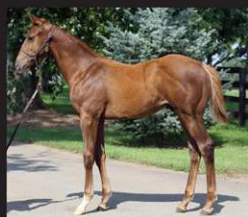
Hip 34 Corinthian-Touch Love Colt selling at Fasig-Tipton NOV.