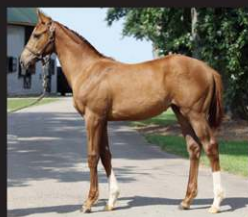
Hip 76 Corinthian-Dreamscape Filly selling at Fasig-Tipton NOV.