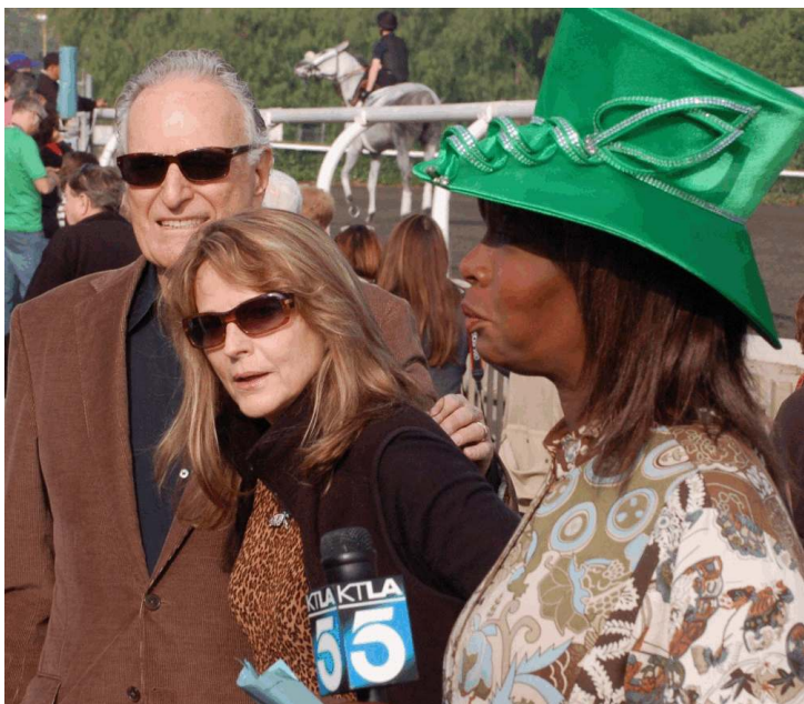
Jerry & Ann Moss Sherackatthetrack