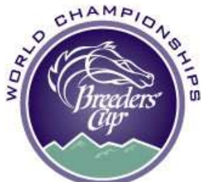
2009 NEW PAGE

The Breeders' Cup's new fan page ( click here ), currently 3,000-plus members strong, boasts fan polls, race replays, photos, racing schedules, gift applications, and much more.