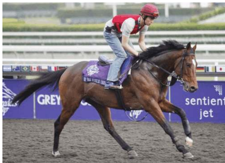
Rip Van Winkle, who goes in the Classic