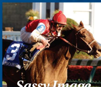
Sassy Image won Pocahontas S-G3 at Churchill on 11/1, earlier placed in Adirondack S-G2 at Saratoga.