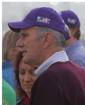
Brereton Jones watching Biofuel train yesterday

Biofuel (Stormin Fever) has made a favorable impression since arriving at Santa Anita, and will bid to give owner/breeder Brereton Jones his first Breeders' Cup winner when she goes postward in the GI Juvenile Fillies Friday afternoon. Dis-