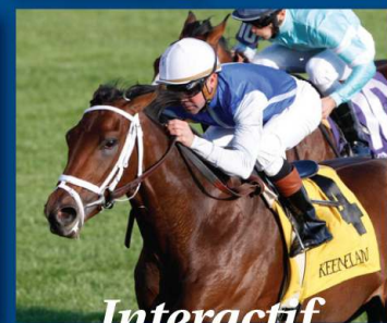
Interactif consecutive graded stakes wins at Saratoga & Keeneland, heads the BC Juvenile Turf tomorrow!