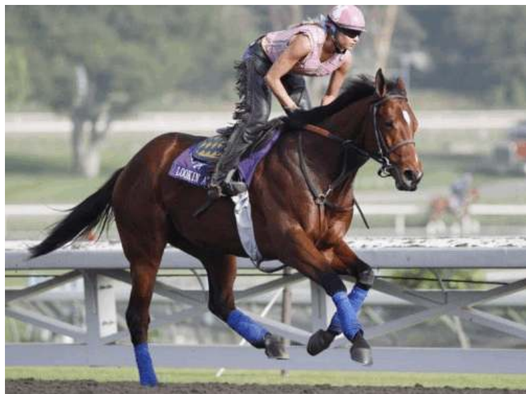
Juvenile hopeful Lookin at Lucky