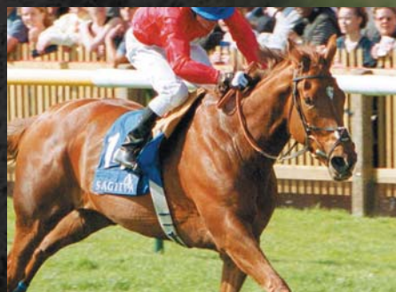
Champion RUSSIAN RHYTHM