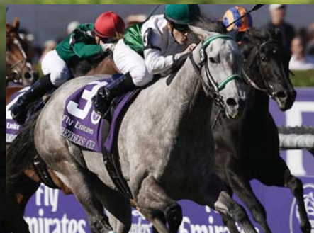
Champion FOREVER TOGETHER