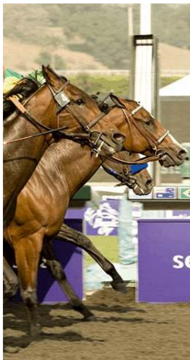
Dancing in Silks gets his nose down