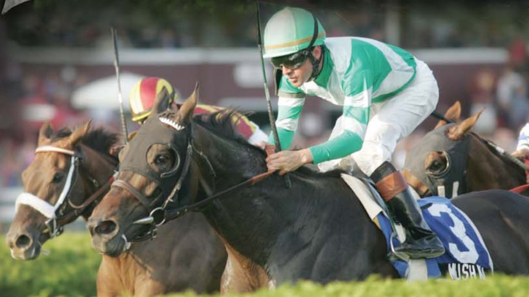
Winner of 2009 Juddmonte Spinster-G1 MUSHKA