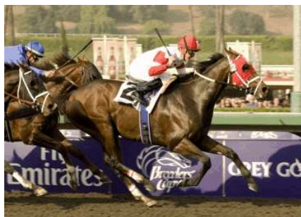
Furthest Land Benoit

Winner of his synthetic track debut at Keeneland Apr. 5, Furthest Land was an overmatched eighth to Einstein (Brz) (Spend a Buck) in the GI Turf Classic, then took the off-turf Golden Bear S. at Indiana Downs June 10. Sent off at 9-10 in the Claiming Crown Jewel July 25, the dark bay atoned for that fourth-place effort with a last-jump victory in the GII Kentucky Cup Classic at Turfway Park Sept. 25. As expected, defending Breeders’ Cup Juvenile champion Midshipman (Unbridled’s Song) jumped fastest of all and set