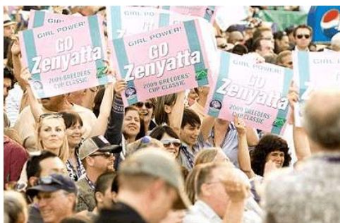
Crowd at Santa Anita