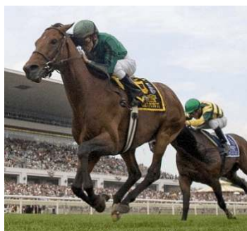
Four Footed Foto

GIO PONTI TO STAY IN TRAINING Castleton Lyons announced yesterday that Gio Ponti (c, 4, Tale of the Cat--Chipeta Springs, by Alydar), runner-up in the GI Breeders' Cup Classic last Saturday, will remain in training in 2010. The bay colt captured four Grade I races on the grass earlier in the year, and is a front-runner for Eclipse Awards as champion older horse and champion turf horse. "Gio Ponti will eventually become a very worthy addition to the stallion ranks at