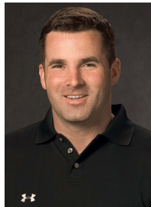
Sagamore's Kevin Plank