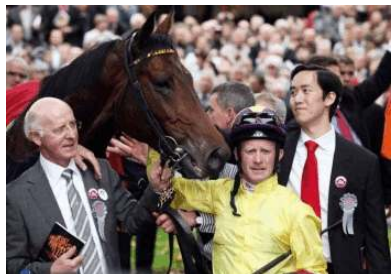
Sea the Stars and Co

The debate as to who will be named the top performer at the Eclipse Awards will continue into the new year, but there's no controversy on the other side of