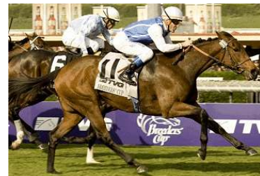
Goldikova

The Wertheimer brothers's dual G1 Breeders' Cup Mile heroine Goldikova (Ire) (Anabaa) was also in line for the Horse of the Year award and, although unlucky to come up against Sea the Stars in that category, was justly handed the champion older horse award. The Freddy Head-trained four-year-old also won the G1 Falmouth S., G1 Prix Rothschild and G1 Prix Jacques le Marois prior to her dazzling display at Santa Anita.