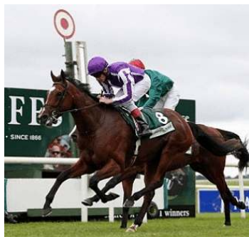
St Nicholas Abbey