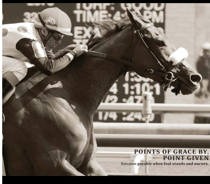
POINTS OF GRACE BY POINT GIVEN $10,000 payable when foal stands and nurses.