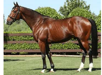
Dylan Thomas - sire of sale-topping hip 811