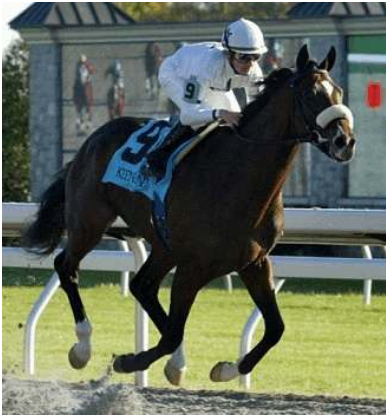
American Lion