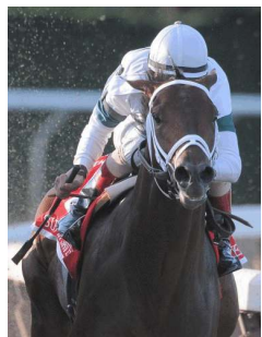
Super Saver