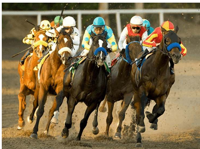
Turning for home in the Prevue

GIII HOLLYWOOD PREVUE S. AMERICAN LION (Tiznow) punches his ticket to the GI CashCall Futurity. GIII DISCOVERY H. HAYNESFIELD (Speightstown) wins with authority. GIII CARDINAL H. ACOMA (Empire Maker) takes it in a thriller.