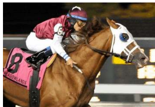
Etched

after his track-record setting win under the lights [nine furlongs in 1:45.93], but his connections opted for this spot instead.