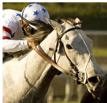
Stardom Bound