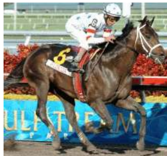
Benny the Bull