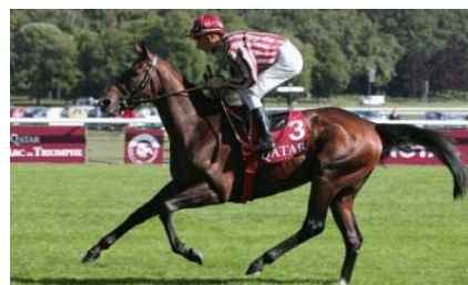
Vision d'Etat

DEAUVILLE CURTAIN CLOSER GETS UNDER WAY With most of Europe's major auctions now done, today sees the switching of attention to Deauville for Arqana's December Sale, which acts as a season finale.