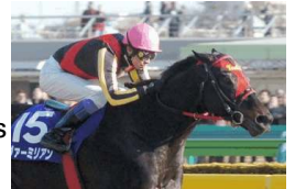
Vermilion