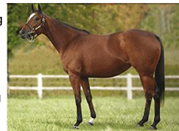
Aquarelle Bleue - Hip 101