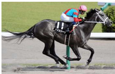
La Verita

La Verita (Unbridled's Song) is a bit of a dark horse in this feature, but is capable of pulling the upset. After