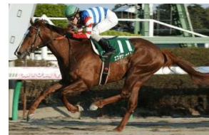
Espoir City

There was a horse who couldn't run to his right last year, and he took us out of the race. The preparation has been perfect this time. All we ask for is a clean race." Espoir City (Jpn) (Gold Allure {Jpn}) comes in off a four-length tally in the Mile Championship Nambu Hai at Morioka