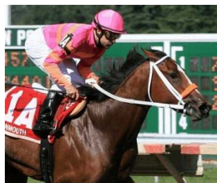
Truth and Justice (2007-'09)