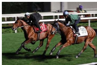
Collection (left) and stablemate Eyshal galloping

Collection looks to become the first locally based winner of this prestigious event since Vengeance of Rain (NZ) (Zabeel {NZ}) scored back in 2005, but his task was made significantly more difficult when he drew widest in the 10-horse field. "Can we do that again?" lamented jockey Darren Beadman. "Gate 10 not perfect. Hope he can get in midfield one off the fence." Winner of the Listed Hampton Court S. at Royal Ascot in 2008, the bay has won three