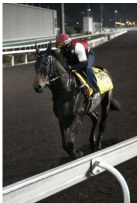
Viva Pataca

Just two of the 15 runnings of the G1 Cathay Pacific Hong Kong Vase have been won by non-European horses, the last being Japan's Stay Gold (Jpn) (Sunday Silence) in 2001. Though Daliapour (Ire) (Sadler's Wells) was purchased privately and raced for Hong Kong