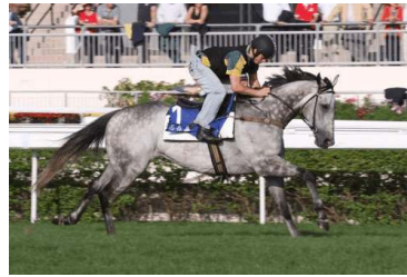
Racing to Win

Racing to Win is the fourth of the Australian representatives on the card and will try to snap the three-race winning streak of the home team. The seven-year-