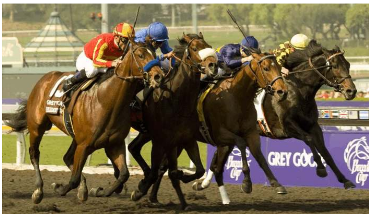
Lookin at Lucky (left) and Noble's Promise (second from right) in 2009 BC Juvenile

The far outside post compromised the chances of Lookin at Lucky (Smart Strike) in the GI Breeders' Cup Juvenile Nov. 7, but he'll have every opportunity to save ground today in the GI CashCall Futurity at Hollywood. The bay utilized his tactical speed to post victories over every form of all-weather available in Southern California, including a debut score over the local Cushion Track July 11 that saw him tabbed a TDN Rising Star . He had inside draws en route to wins in the GI Del Mar Futurity on Polytrack Sept. 7 and the GI Norfolk S. on the crosstown Pro-Ride Oct. 4. Forced into a troubled overland trip in the Breeders' Cup, the dependable colt came up a head short to Godolphin's improbable winner Vale of York (Ire) (Invincible Spirit {Ire}), with Noble's Promise (Cuvee) a half-length back in third. Lookin at Lucky spearheads a triumvirate from trainer Bob Baffert, who equalled D. Wayne Lukas with four winners in this race when Pioneerof the Nile (Empire Maker) scored last year. "This is when you find out what you really have," Baffert told Daily Racing Form . "This is the closest surface we have to dirt." Baffert's other Futurity winners include 1997 hero Real Quiet (Quiet American), who went on to wear the GI Kentucky Derby roses the following spring; and 2000 victor Point Given (Thunder Gulch), the Horse of the Year for 2001. Lookin at Lucky will have a bit of a break following today's race. "I just want to run him a couple of times before the Derby," Baffert added.