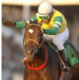
Interaction