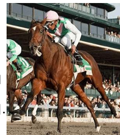
Proviso prior to her DQ from first in the G1 Juddmonte Spinster EquiSport