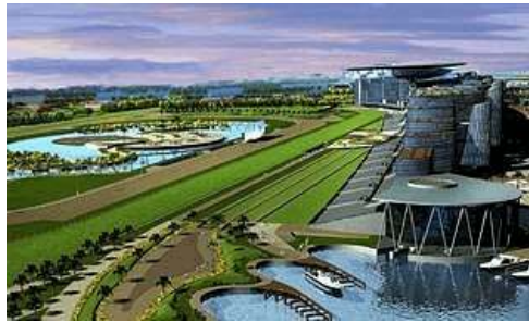
Meydan Racecourse meydan.ae

Officials at Meydan Racecourse might transfer the G1 Dubai Golden Shaheen, part of the Dubai World Cup card, to the new racing venue's turf course, Racing Post reports. Inaugurated in 1996, the 1200-meter dash had been contested solely over a straight-ahead