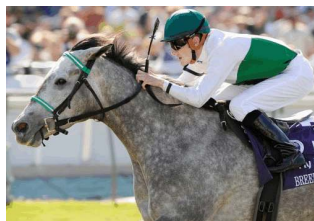
Forever Together

It isn't too surprising that Belong to Me is showing promise as a broodmare sire, as plenty of his daughters feature among his best winners. His Grade I-winning daughter Circle of Life has already made her mark