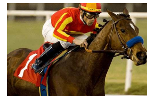
Lookin at Lucky

Lookin at Lucky's dam Private Feeling wasn't in the same class as these Grade I winners by Belong to Me. Indeed, she won only $18,245 during a seven-race career. She is, though, a half-sister to the Grade III winner Grand Charmer, who has found fame as the second dam of the champion filly Wait a While, and her third dam is Sleek Dancer, who has a host of stakes-winning descendants, including the G1 Irish Derby winner Sir Harry Lewis.