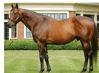
Smart Strike

It is well worth mentioning that Lookin at Lucky comes from Smart Strike's first crop, sired at a fee as high as $50,000, with the Lane's End stallion's next three crops, respectively, sired at fees of $75,000, $150,000 and $125,000. As the $50,000 crop also includes On Verra, runner-up in the G1 Prix Marcel Boussac, and Zanzibari, winner of the G3 Prix de Cabourg, there's reason to get excited about these future crops.