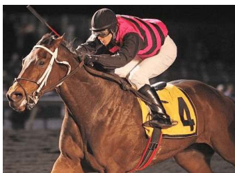
Bad Action