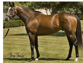
Pollard's Vision

In these circumstances, it isn't surprising Carson City's son Pollard's Vision ranks as high as third on the current freshman sires' table in order of prizemoney and joint-second by total of stakes winners, with the admirable total of four. That said, I doubt whether many would have forecast such a bold showing from the Wintergreen Stallion Station resident. He is in the lower price range (which is proving particularly vulnerable in the credit crunch) and received only 36 mares in 2009, his fourth season (which is difficult enough in normal circumstances).