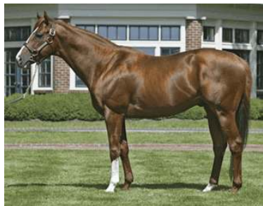
City Zip

This background helped Carson City pass on his precocity to plenty of his progeny. By the time of his death at the end of 2004, his total of two-year-old winners stood at nearly 200--some 25 percent of his named foals--and no fewer than 14 of his juveniles enjoyed graded/group success at two. These were City Zip (GI Hopeful S. and three other graded races at two), City Band (GI Oak Leaf S.), Cuvee (GI Futurity S.), Boone's Mill (GII Sapling S.), Chace City (GII Saratoga Special), Classic Elegance (GII Schuylerville S.), Paved in Gold (GII Astarita S.), Sir Gerry (G2 Gimcrack S.), Leelanau (GIII Kentucky Breeders' Cup S.), Moonlight Sonata (GIII Arlington-Washington Lassie S.), Dublin (G3 Vintage S.), Dont Tell the Kids (GIII Sapling S.), Effectual (GIII Debutante S.) and Imperfect World (G3 Prix du Bois).