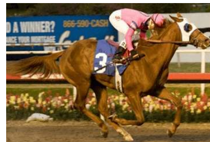
Blind Luck

While this remote duplication is interesting, we mustn't overlook the fact that each of Blind Luck's first three dams has now produced a graded winner. Her dam Lucky One is a half-sister to Ethan Man (Glitterman), winner of the GIII Swale S., while her second dam, the Imp Society mare Twilight Spectre, is a half-sister to the talented sprinter Chas Conerly (Big Burn).