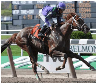
Bribon