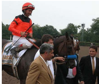
Roman Ruler heads to Monmouth’s winner’s circle following the 2005 GI Haskell Invitational

Strongly supported at his first season at stud, Roman Ruler’s first two-year-olds have hit the ground running. From his first crop of 135 foals, Roman Ruler is represented by 29 winners, including three black-type