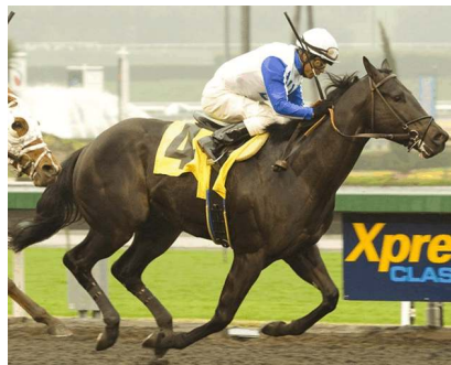
Roman Ruler's Tiny Woods winning at Santa Anita yesterday

In what has shaped up as one of the tightest freshman sire races in years, Darley stallion Offlee Wild (Wild Again--Alvear, by Seattle Slew) and Hill 'n' Dale Farm's Roman Ruler (Fusaichi Pegasus--Silvery Swan, by Silver Deputy) come down to the wire together in the battle to determine the leading first-crop sire for the 2009 season. Darley's resident stood at the top of the leader board heading into yesterday's racing action with