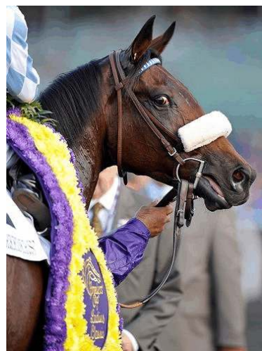
Life Is Sweet

Grade I winners Diamondrella (GB) (Rock of Gibraltar {Ire}) and Life Is Sweet (Storm Cat) face off in today's GII San Gorgonio H. at Santa Anita. ★ "TDN Rising Star" ★ Life Is Sweet, first or second in four of her five grass starts, makes her first appearance since a