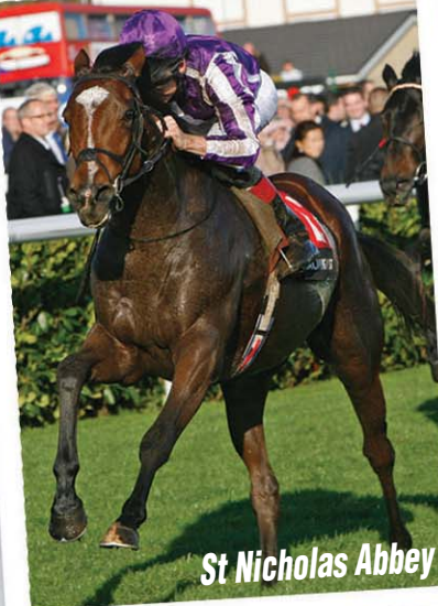
St Nicholas Abbey

Won Royal Lodge Stakes- Gr.2 at 2 years, 2009