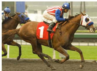
and at Santa Anita

"He ran green, but we were hoping he would run like we thought he could. He'd been working well with nice horses, but I didn't want to run him short, because he would have got nothing out of it." The chestnut's education will continue in an allowance race. "We'll run him in non-winners [of one]," Baffert added. "It's sort of tough moving up too fast, but at least I snuck in a two-year-old race for him."