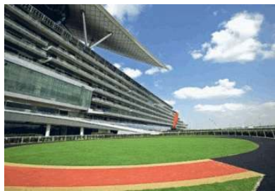
Meydan's Walking Ring