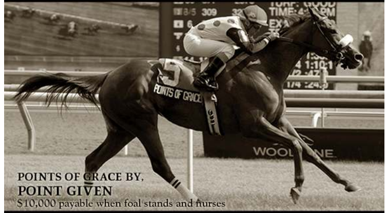
POINTS OF GRACE BY POINT GIVEN $10,000 payable when foal stands and nurses

Eclipse Award Winner POINT GIVEN is also a Champion-making sire. Sire of three-time Canadian Champion SEALY HILL, he now has another filly, POINTS OF GRACE, in the running for year-end Sovereign honors.