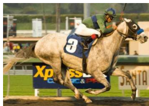
Concord Point