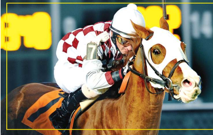
JAN. 30 - ACTING ZIPPY, 1ST JOHN B. CONNALLY TURF-G3 Click for video