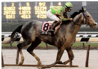
Dry Martini

The Donn has attracted two battle-tested millionaires in addition to Quality Road. Dry Martini (Slew Gin Fizz) bankrolled over half of his career earnings of $1.2 million in 2009, his most important and valuable success