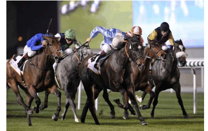
Soneva (middle) goes for home in the Cape Verdi