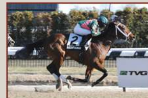
Age of Humor