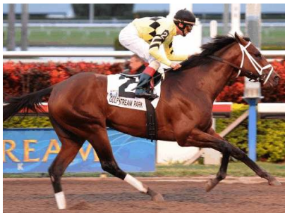
Quality Road