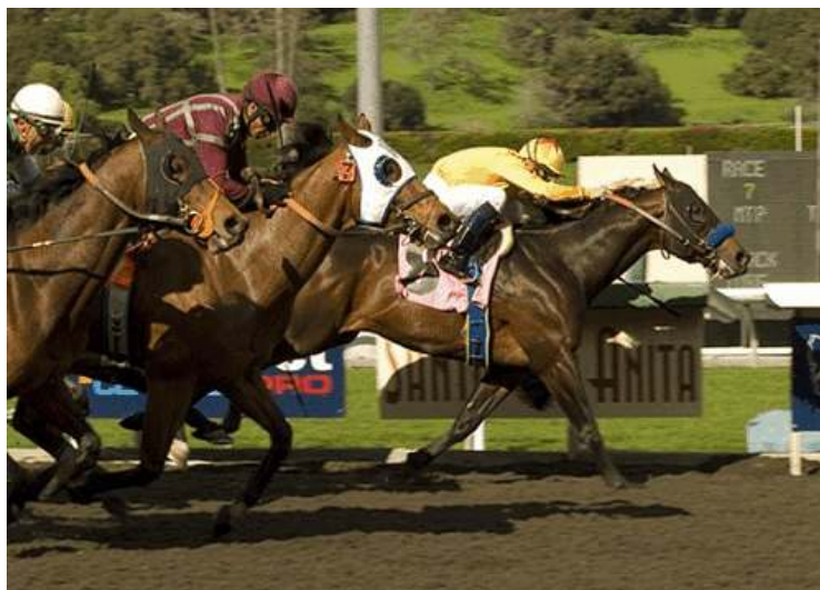
Richard's Kid edges out Dakota Phone (blinkers)