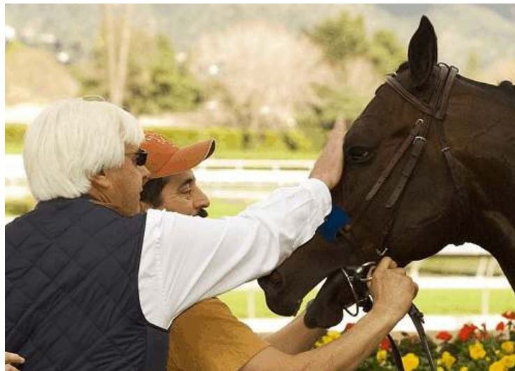
Trainer Bob Baffert