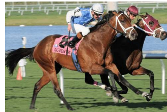
Interactif (outside) & Bim Bam A Coglianese

Bim Bam, winner of Calder's Foolish Pleasure Breeders' Cup S. last September, moved to the lawn to win the Arthur I. Appleton Juvenile Turf S. in his 2009 finale Nov. 14. The bay returned to come up just a neck short