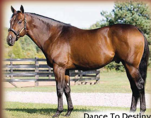
Dance To Destiny

Sire of 2YO/3YO SW ME THE SEA AND G T ($180,876)