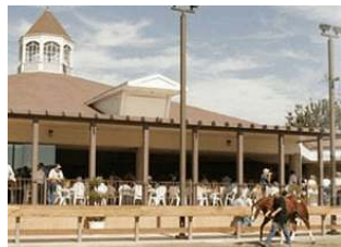
Hinds Pavilion

A total of 134 juveniles have been catalogued for the Barretts March Sale of Selected Two-Year-Olds in Training,