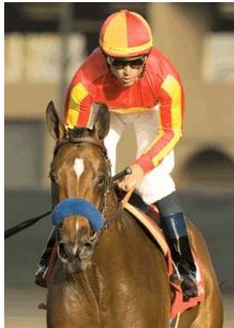
Lookin at Lucky

He has the pedigree. Lookin at Lucky is by Smart Strike, one of the top sires in the nation. Smart Strike is the sire of Curlin, English Channel, Fabulous Strike, Furthest Land and other notable stakes winners. His offspring typically have no problem when it comes to the kind of stamina required to win the Kentucky Derby.