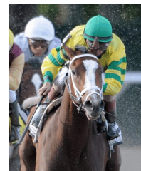
Devil May Care

Jody Slew appears to have turned the corner and should get a favorable set up in front of her. A distant 10th in the GIII Pocahontas S. going Churchill's one-turn mile Nov. 1, the bay improved dramatically to round out the triple at 76-1 in the grassy Caressing H. in Louisville Nov. 28. She was overlooked at 23-1 in this track's Tiffany Lass S. Jan. 23, but rallied from 12 lengths back after a half-mile to defeat Bella Medaglia by a half-length. Devil May Care returns to the main track for her sophomore debut. A maiden winner in the Saratoga slop Aug. 29, the half-sister to GSW Regal Ransom (Distorted Humor) added a head success in the GI Frizette S. Oct. 10, but failed to handle the Santa Anita Pro-Ride and was 11th in the GI Breeders' Cup Juvenile Fillies. Quiet Temper , the GIII Delta Princess S. heroine three back, looks to make amends here for a flat fifth in the Tiffany Lass.