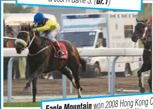
Eagle Mountain won 2008 Hong Kong Cup (Gr.1) & 2nd BC Turf (Gr.1)