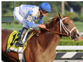
Dublin

which had a significant impact on two of the probable favorites, undefeated ★ "TDN Rising Star" ★ Conveyance (Indian Charlie) and last year's GI Three Chimneys Hopeful S. winner Dublin (Afleet Alex). Conveyance, winner of the GIII San Rafael S. over Santa Anita's Pro-Ride Jan. 16, was originally assigned post two, but now finds himself in post eight. Dublin would have been marooned out in post 10, but now has drawn post three in his seasonal bow. The San Rafael was Conveyance's first start over a route of ground, and trainer Bob Baffert is hopeful the switch to conventional dirt will be beneficial for the