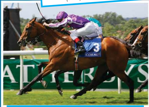
Mount Nelson won 2008 Eclipse S. (Gr.1) & Criterium Intl (Gr.1) at 2 yrs; sire.