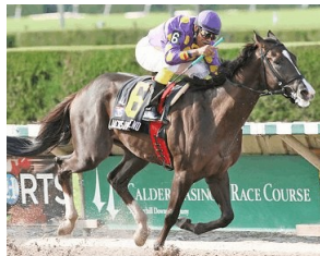
Jackson Bend