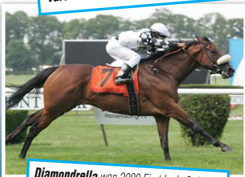
Diamondrella won 2009 First Lady S. (Gr.1) & Just A Game S. (Gr.1)