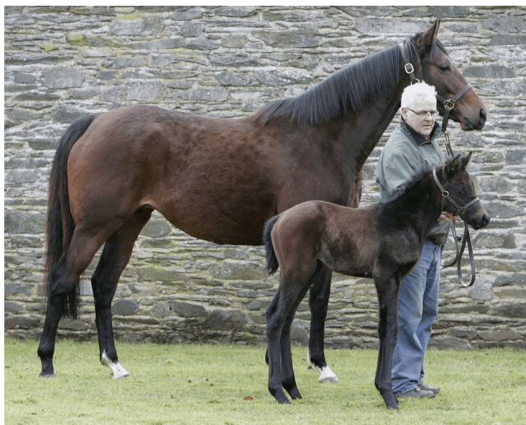
Zarkava with her first foal, a filly by Dalakhani