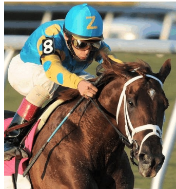
Eskendereya