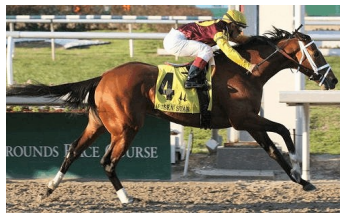
Discreetly Mine

Discreetly Mine (Mineshaft) and Tempted To Tapit (Tapit), who ran one-two all the way around the course in Saturday's GII Risen Star S. at the Fair Grounds,