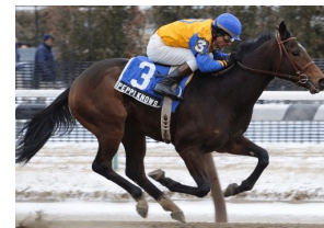
Peppi Knows

The top three finishers of the Feb. 6 Whirlaway S.-- Peppi Knows , Afleet Again and Three Day Rush --lock horns again in this prep for the GI Wood Memorial S. Nacho Friend , an impressive maiden winner at Monmouth last June, makes his first start since a fourth-place finish in the GII Sanford S. at Saratoga July 30.