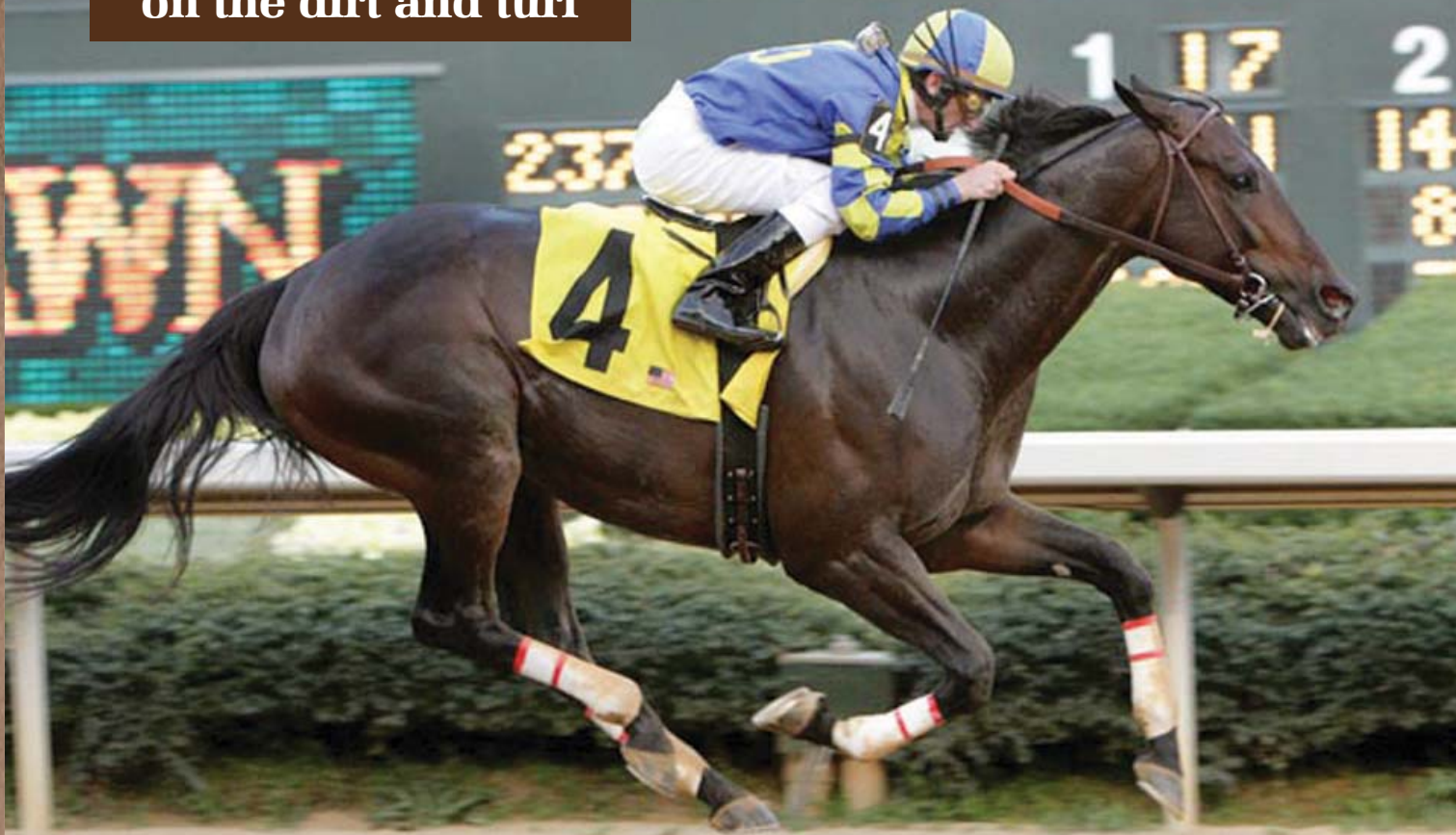
Purim winning the 2006 Razorback Handicap (G3).