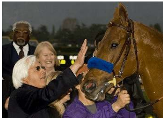
Breeder/trainer Bob Baffert and Misremembered