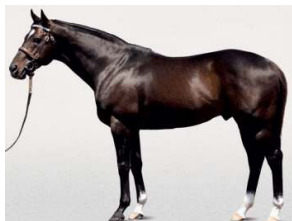
Medaglia d'Oro darleyamerica.com