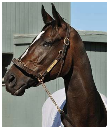
Zenyatta