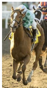
Striking Dancer