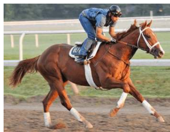
Dublin

Champion Lookin At Lucky attempts straight-up dirt in his sophomore debut, having collected Grade I wins on all three synthetic surfaces available in Southern California. He sustained his sole career defeat when second by a head in the GI Breeders' Cup Juvenile Nov. 7, but confirmed his Eclipse Award credentials with a typically professional score over Noble's Promise in the GI CashCall Futurity at Hollywood Dec. 19. Trainer Bob Baffert will add blinkers to the colt's equipment for his first out-of-town trip. "This is going to be an experimental race," Baffert told Daily Racing Form . "I'm only allowed one experimental race, and it's got to be right now. We'll see how he handles the dirt and the ship. There's a lot of things involved. We'll find out a lot about him." Noble's Promise, hero of the GI Dixiana Breeders' Futurity on Keeneland's Polytrack Oct. 10, will also be making his first appearance on dirt here. The third Grade I winner in the field is Dublin , who finished off the board in two starts following his victory in the GI Three Chimneys Hopeful S. at Saratoga. Having