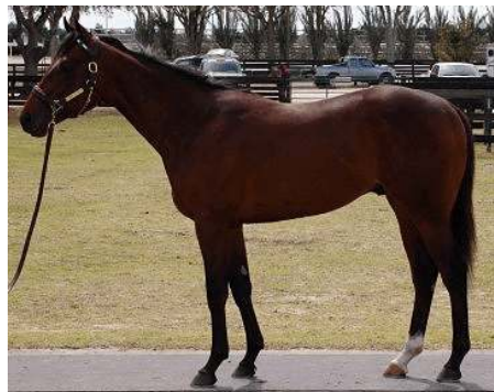
Hip 93, by Smart Strike