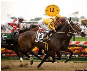
The 2009 Preakness

STAKES SCHEDULE The $1-million GI Preakness S. May 15 will once more highlight Pimlico's 2010 stakes