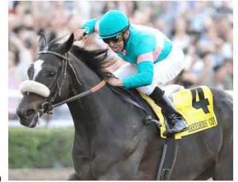
Zenyatta taking the '09 Breeders' Cup Classic