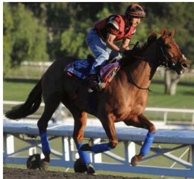
Awesome Act