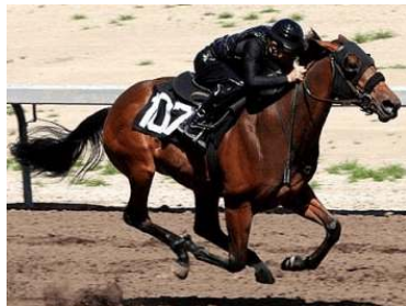
Hip 107 - Tiznow filly