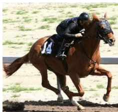
Hip 14 - Touch Gold colt