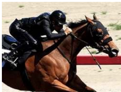
Hip 47 - Harlan's Holiday filly