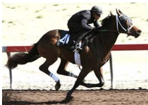
Hip 41 - Flatter colt