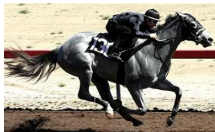
Hip 130 - Unbridled's Song colt