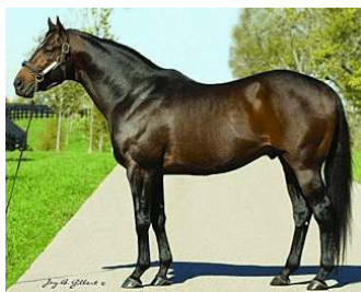
Malibu Moon spendthriftfarm

at very different fees, which clouds the picture consid- erably. In the years that Malibu Moon was toiling in Maryland at a fee of $3,000, Pulpit's services were priced from $40,000 to $75,000. It was only five years ago that the gap began to close, with Malibu Moon's fee jumping to $17,500 in 2005, when Pulpit stood at $60,000. The next year saw the young pretender at $30,000, compared to Pul- pit's $80,000, and 2007, 2008 and 2009 saw the gap close to $40,000, when Malibu Moon's fee rose to its current level of $40,000.