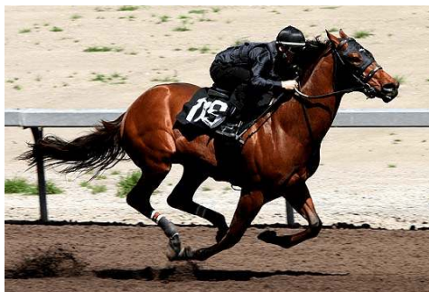
Hip 119

In addition to the topper, Narvick started the sale on a positive note, signing a $125,000 ticket for hip 1 , a daughter of Lemon Drop Kid--Magic Broad (Broad