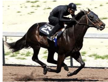
Hip 29 strutting his stuff