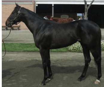
Hip 29 MK photo