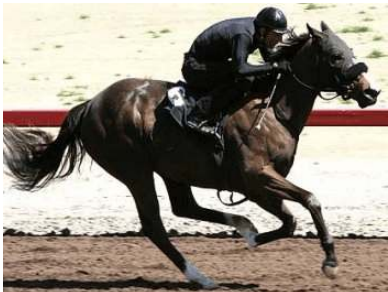
Hip 6