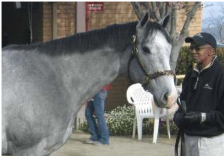
Barretts March Sale Topper, Hip 130