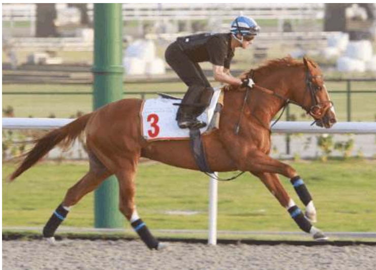
Crowded House stretches his legs at Meydan