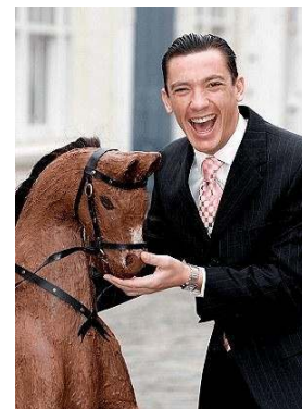
Dettori & Friend

It's good to be the king. Frankie Dettori, first-call rider for Godolphin, had the pick of four top-class runners for the G1 Dubai Sheema Classic over the metric mile and a half, and landed on 2009 G1 Prix de l'Arc de Triomphe third-place getter Cavalryman (GB) (Halling). In the end, he selected the four-year-old over a group including defending race champion Eastern Anthem (Ire) (Singspiel {Ire}), Campanologist (Kingmambo) and Anmar (Rahy). "Campanologist is one of my favorites--he is a great character and always a challenge to ride, but I love him," Dettori explained. "However, he is a Group 2 horse, so I had to go with Cavalryman, who did not take to the all-weather surface last time. He would have needed that race, and he has improved a lot judged on his homework, and, like Campanologist, he is very tough, and on his third to Sea the Stars in the Arc he must have a chance in what is another open race." Cavalryman was a top sophomore in France last summer, with wins in the G1 Grand Prix de Paris and G2 Prix Niel prior to his Arc effort. In his lone appearance this season, he was no better than seventh in Round 3 of the G2 Maktoum Challenge in what was to be a prep for the World Cup. Sheema Field, p3