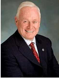
Sen. Marty Golden