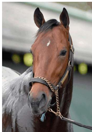
Gio Ponti

The post-position draw for Saturday's $10-million G1 Dubai World Cup was held last evening at The