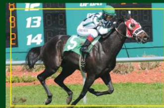
ZORI'S EYE 3/17 - MSW at Tampa by 5 lengths