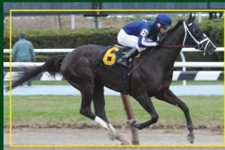
INNER GROOVE 3/25 - MSW at Aqueduct by 5 lengths