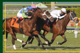
DOUBLES PARTNER 2/17 - Gulfstream Allowance