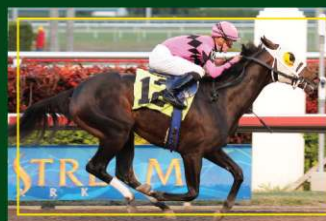
BEST ACTOR 1/7 - MSW at Gulfstream by 4 lengths