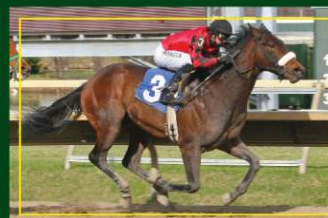
KING ROCK 3/27 - ALW at Philadelphia