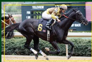
NEW MADRID 3/13 - LE Grad; MSW at Oaklawn