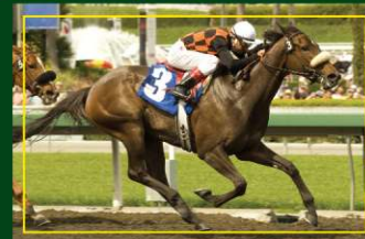
HARD WAY TEN 3/21 - MSW at Santa Anita