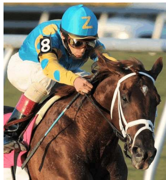
Eskendereya

In the wake of his dominant win in the Feb. 20 GII Fountain of Youth S., Zayat Stables' Eskendereya (Giant's Causeway) has been installed the 4-5 favorite in Saturday's GI Wood Memorial at Aqueduct. The strapping chestnut will break from post three in the six-horse field. Eskendereya, who wintered in Florida, arrived at trainer Todd Pletcher's Belmont barn Wednesday afternoon.